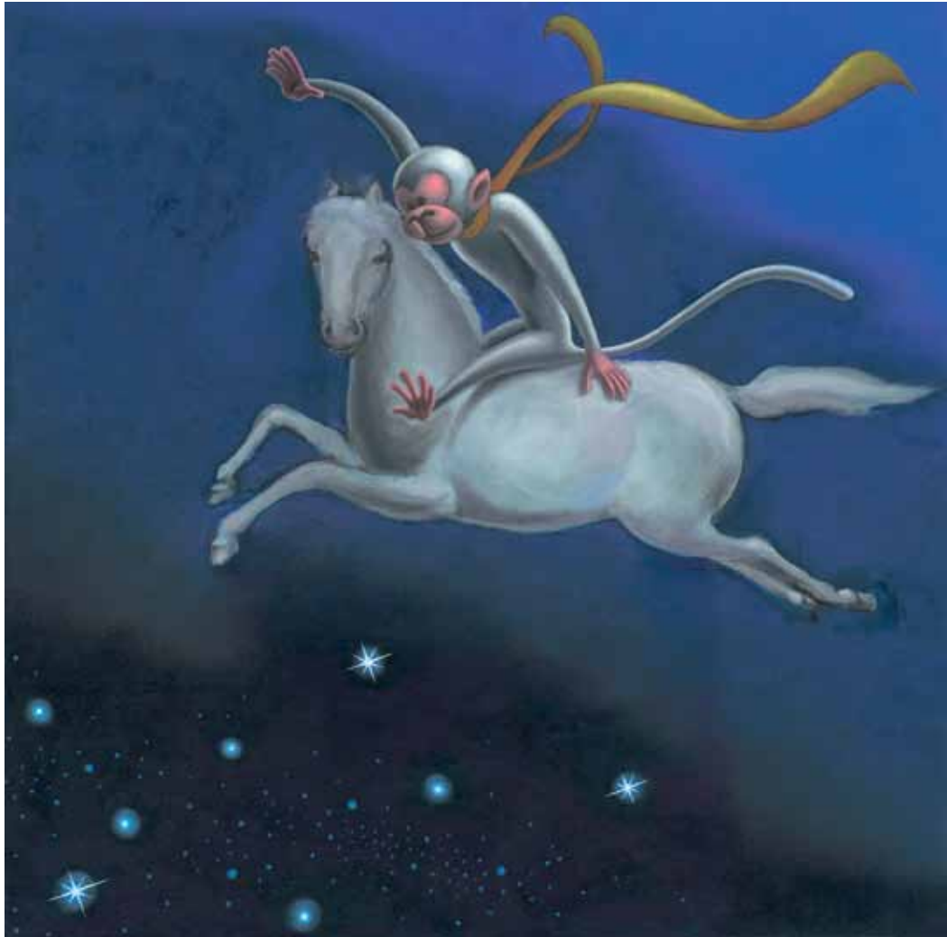
Gleda dol 俯视 Looking Down 2016, olje, platno / oil on canvas, 60 x 60 cm