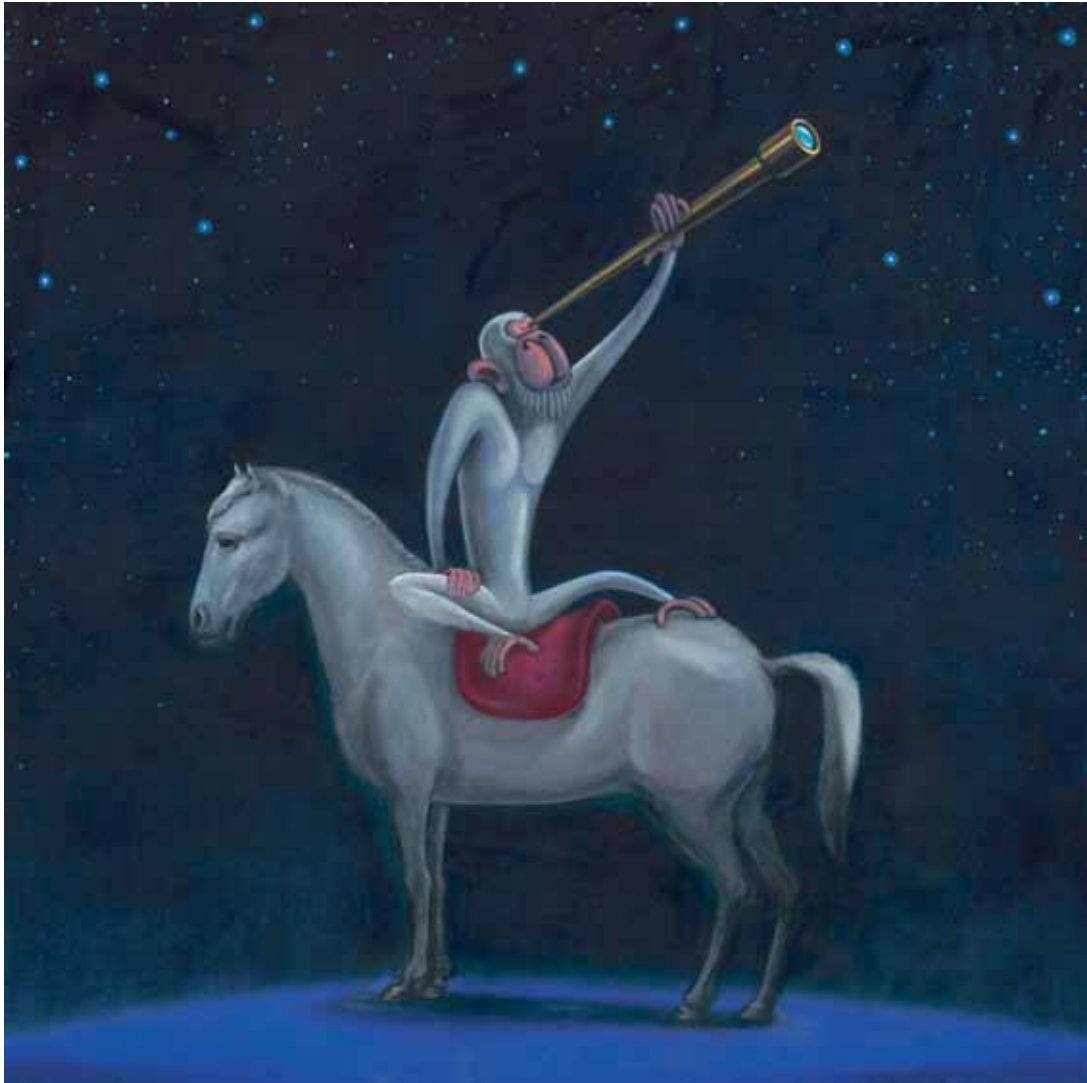
Iskanje Eve 远程探索 Finding Eve 2016, olje, platno / oil on canvas, 70 x 70 cm