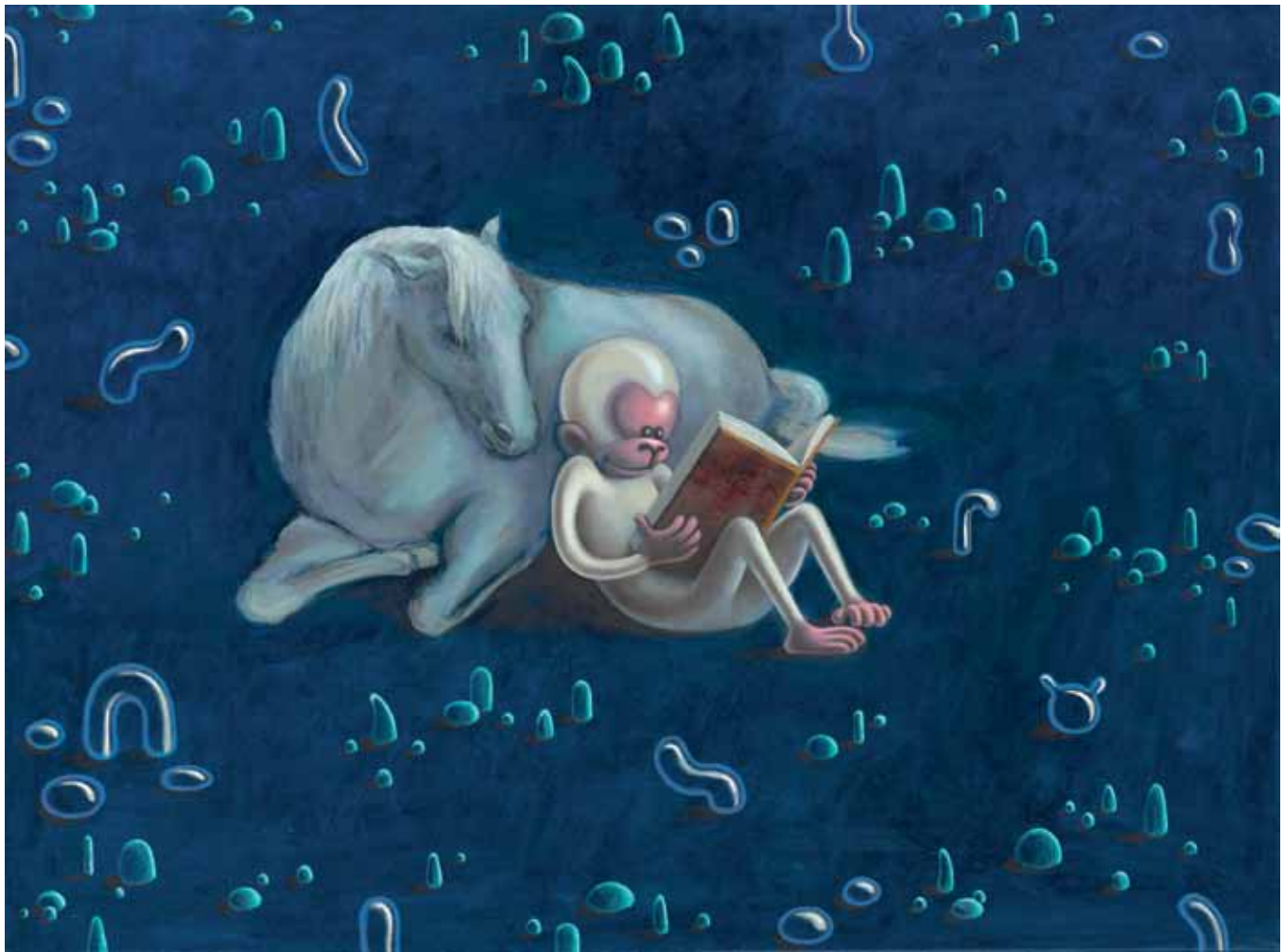
Nočno branje 夜读 Bedtime Stories 2016, olje, platno / oil on canvas, 60 x 80 cm