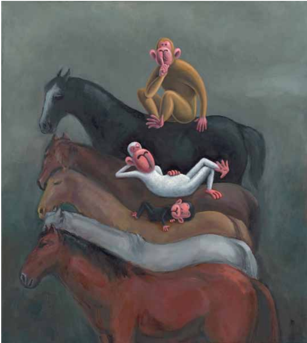
Na vrhu sveta 聆听 On the Top of the World 2016, olje, platno / oil on canvas, 50 x 50 cm