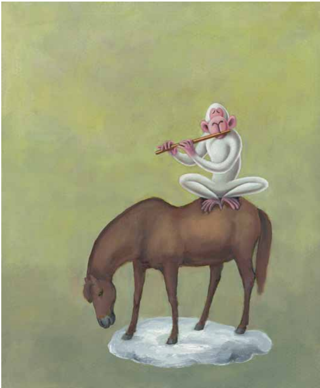
Svitanje 祥云 Dayspring 2016, olje, platno / oil on canvas, 60 x 50 cm