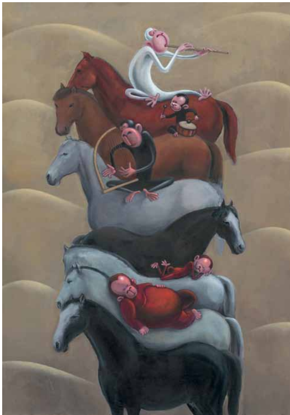
Med nebom in zemljo 天地之间 Between Heaven and Earth 2016, olje, platno / oil on canvas, 100 x 70 cm