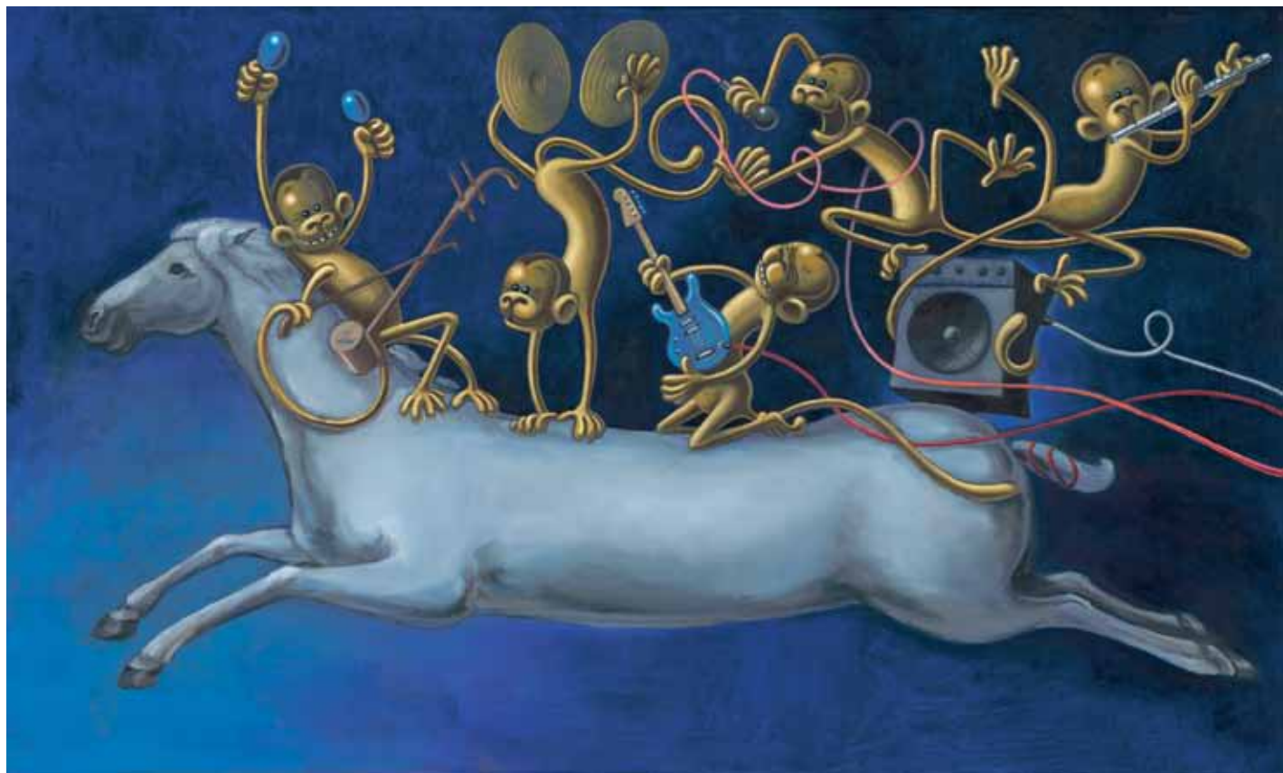
Na konju 马上快乐 In the Saddle 2016, olje, platno / oil on canvas, 60 x 100 cm