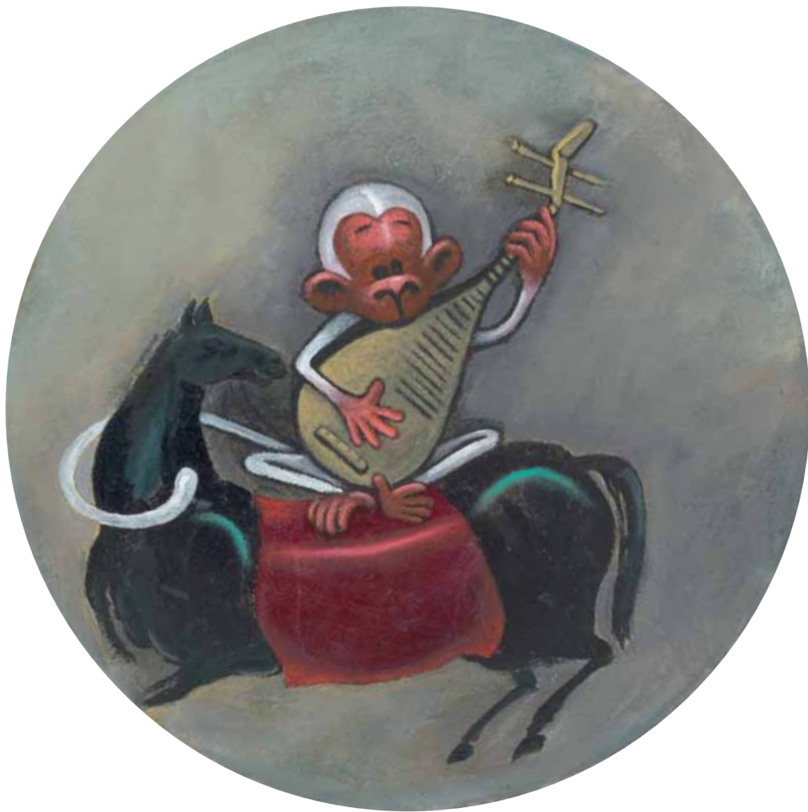
Rondo 抒情 Rondo 2016, olje, platno / oil on canvas, ø 35 cm