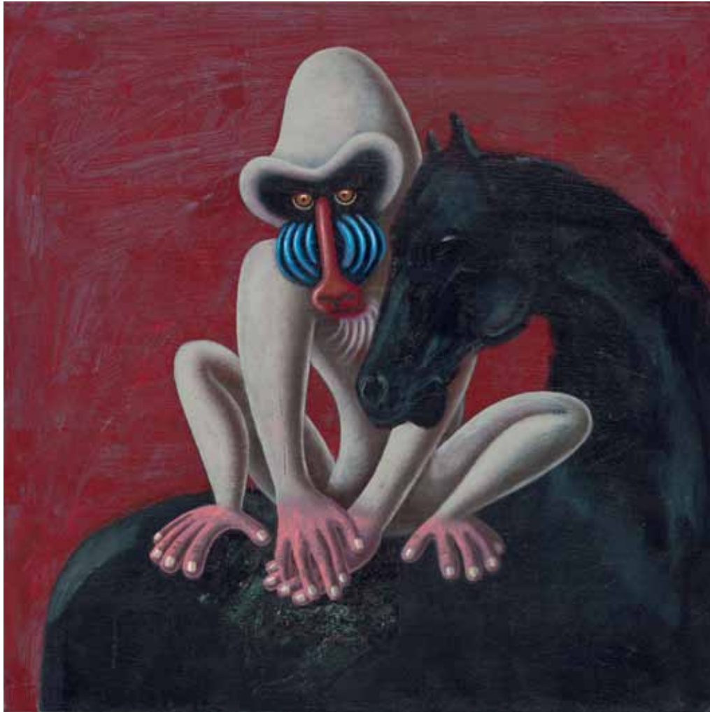
Žegnanje umetnosti 美的祝福 Blessing Art 2016, olje, platno / oil on canvas, 40 x 40 cm