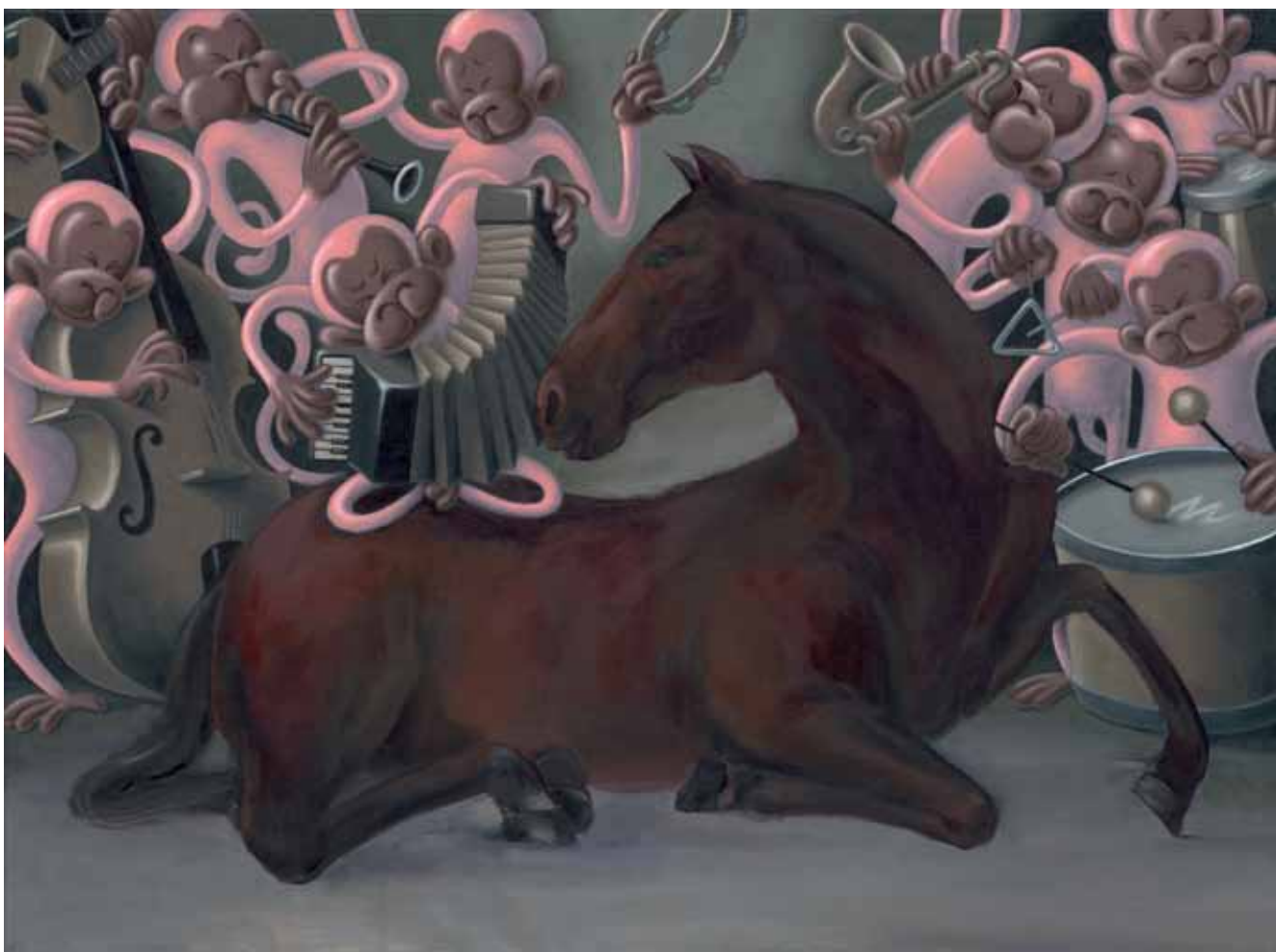
Capriccio 随想曲 Capriccio 2016, olje, platno / oil on canvas, 60 x 80 cm