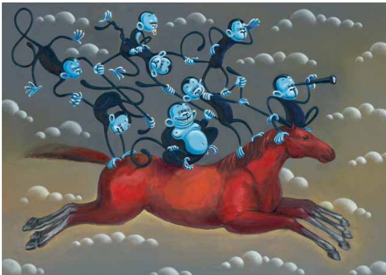
Galop 马上奔驰 Canter 2016, olje, platno / oil on canvas, 70 x 100 cm