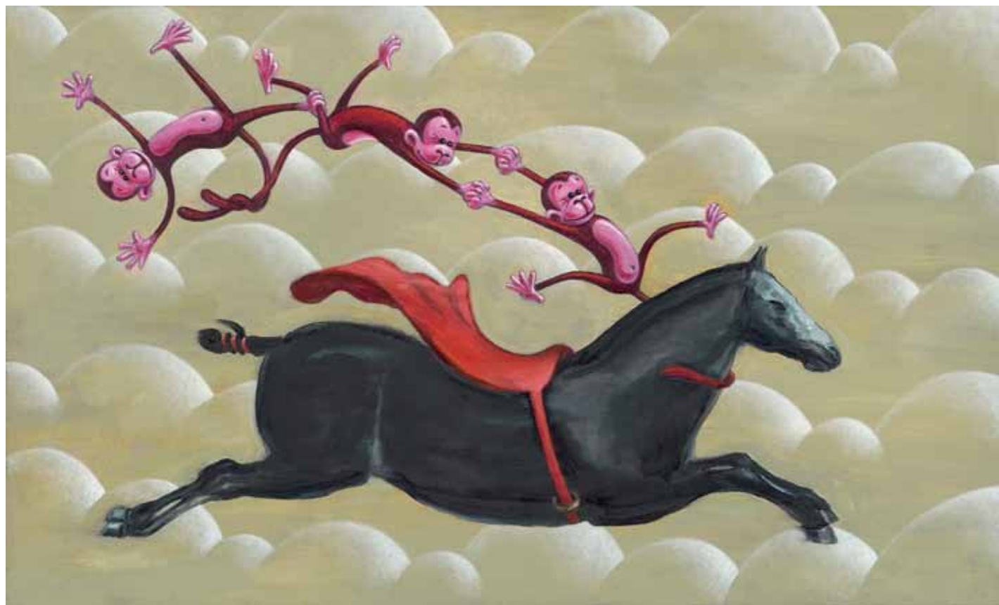
Sanje o umetnosti 梦之曲 Dreaming Art 2016, olje, platno / oil on canvas, 60 x 100 cm