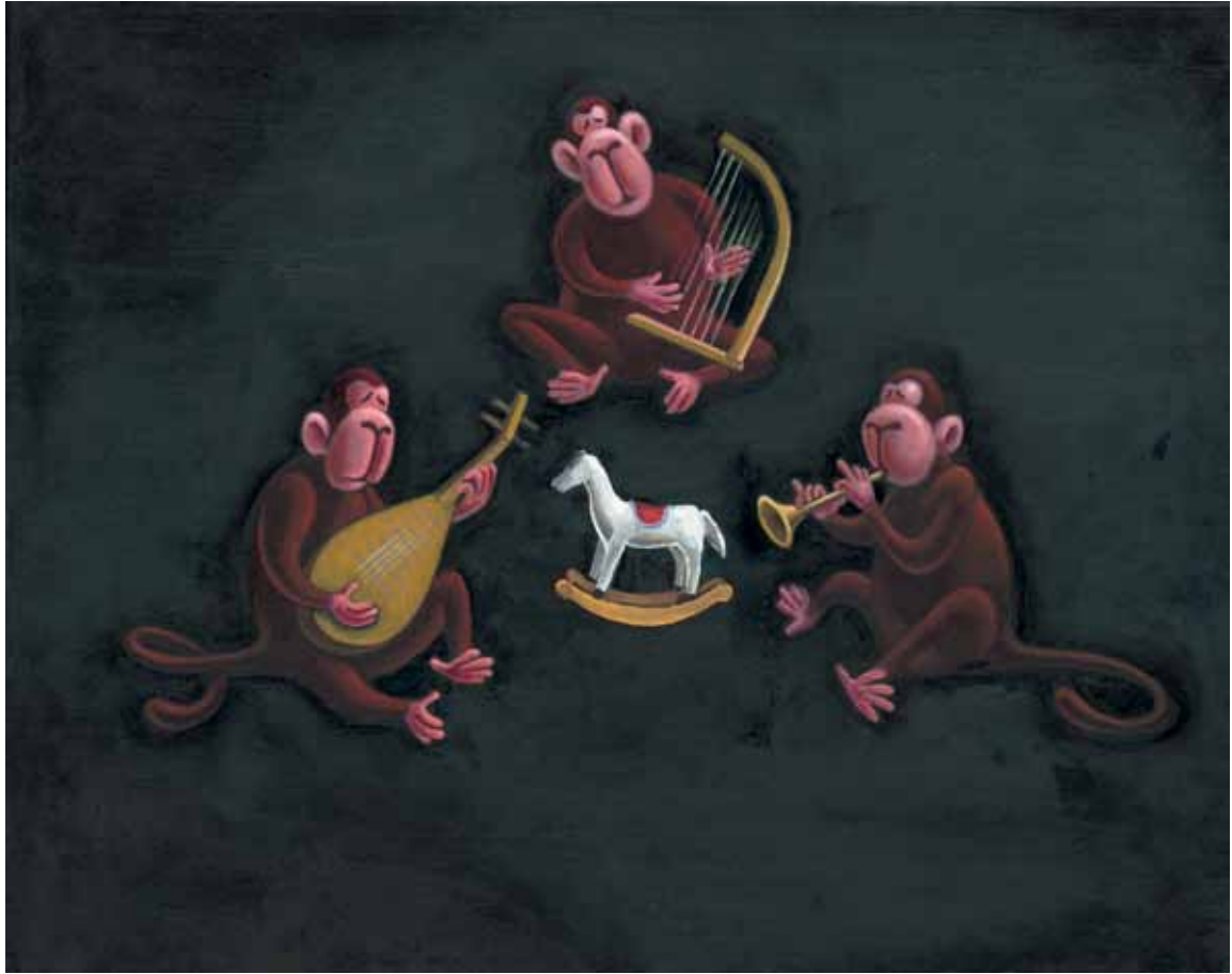
Uspavanka 夜曲 Lullaby 2016, olje, platno / oil on canvas, 40 x 50 cm