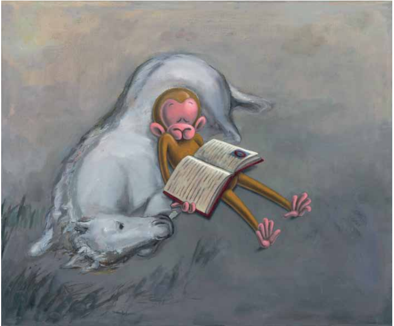
Bratje Karamazovi 少憇 The Brothers Karamazov 2016, olje, platno / oil on canvas, 50 x 60 cm